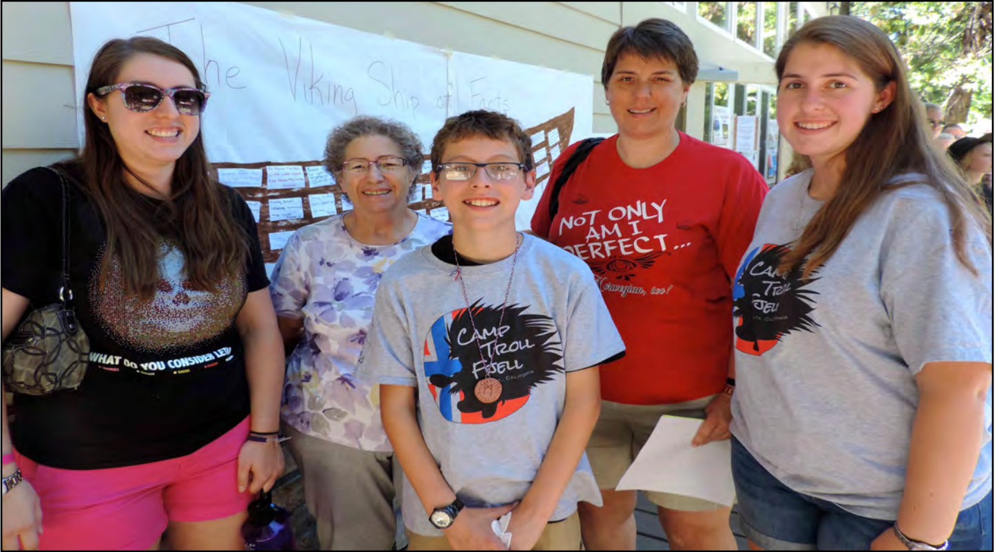
The Malme / Bradley Family taking in camp activities.